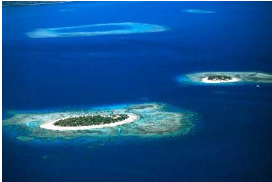
Beachcomber and Treasure Islands in Fiji's Mamancua Island group - ocean swimming heaven and quite a bit of fun on the side!

Our 18km relay from the Sofitel Fiji Resort & Spa to Beachcomber Island is rated in the top 50 ocean swims in the world by the USA website 10km swimmer.