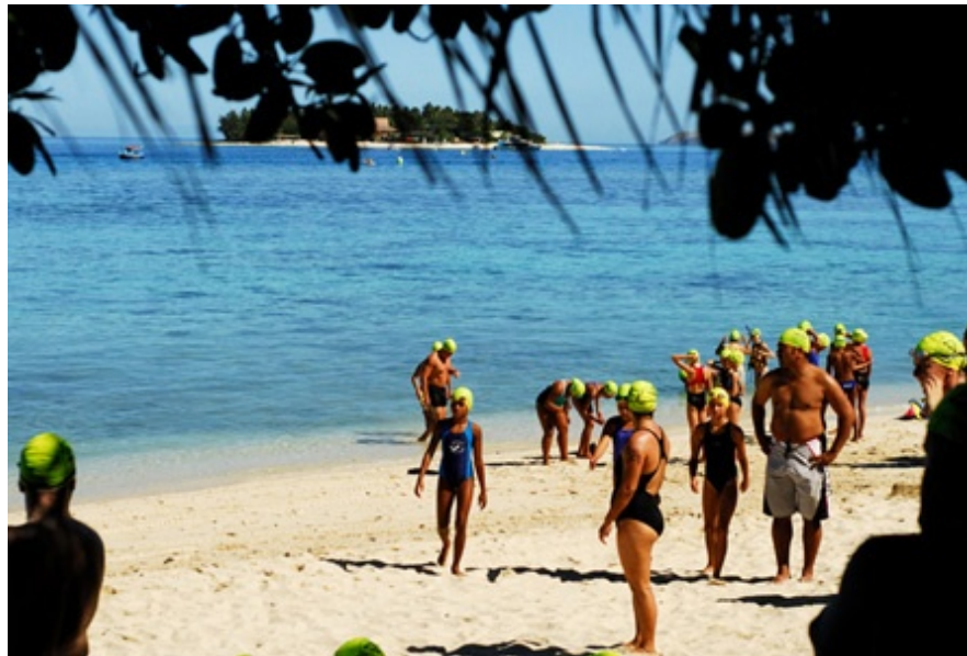
The start of the Fiji Swims - 1km Treasure Island to Beachcomber Island race