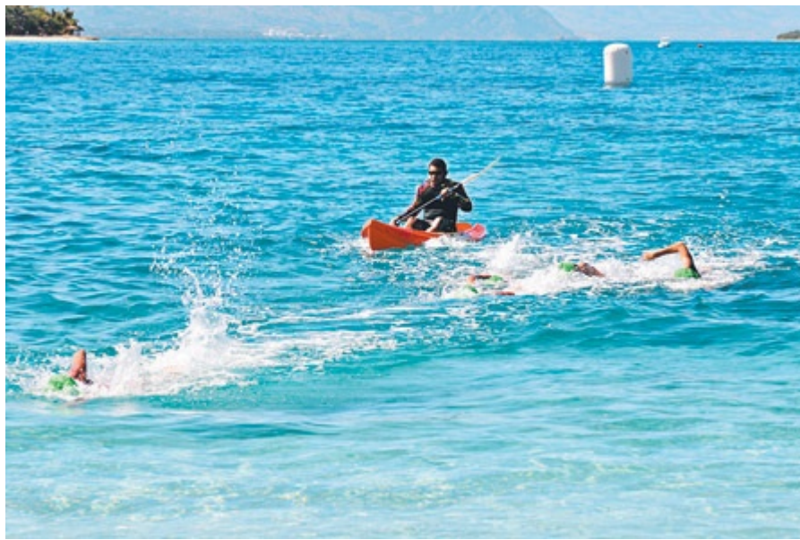
The lead pack in the 2.7km Beachcomber Island Swim