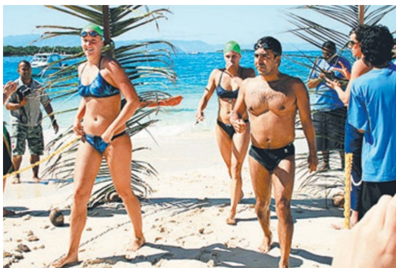
Team California finishing the 18km Fiji Swim - Sofitel Fiji Resort & Spa to Beachcomber Island Relay

The only thing assured in this race is it's fun and a great experience.